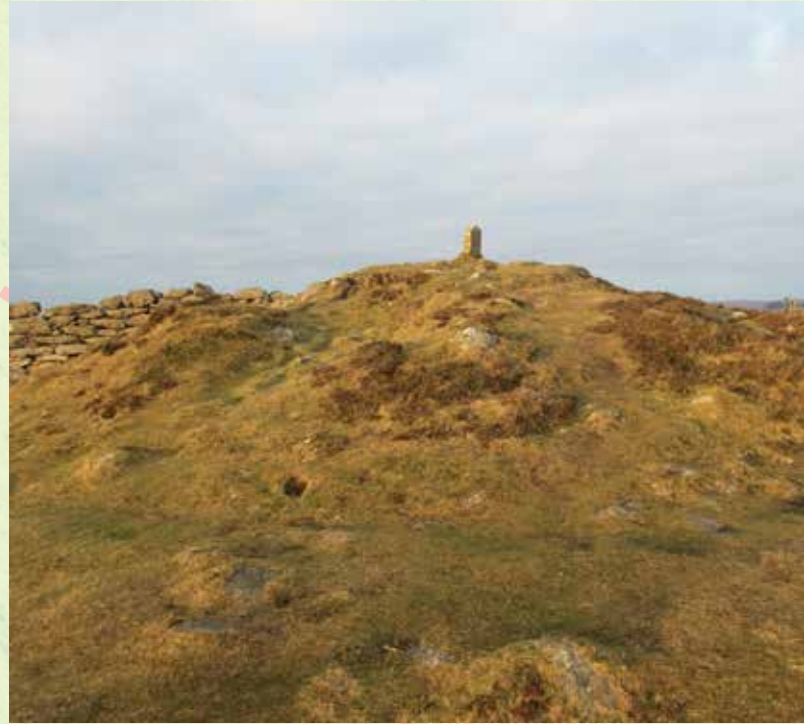
Hameldown Beacon in the distance