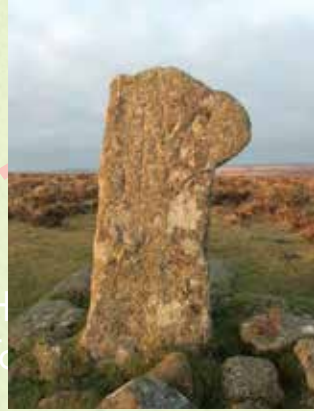
Hameldown Cross picture taken 2016

K To the right you will see the medieval Hameldown Cross; highest of all the Dartmoor crosses. It is thought that it was moved from its original position to serve as a bound stone, one of many showing the extent of the Manor of Natsworthy.