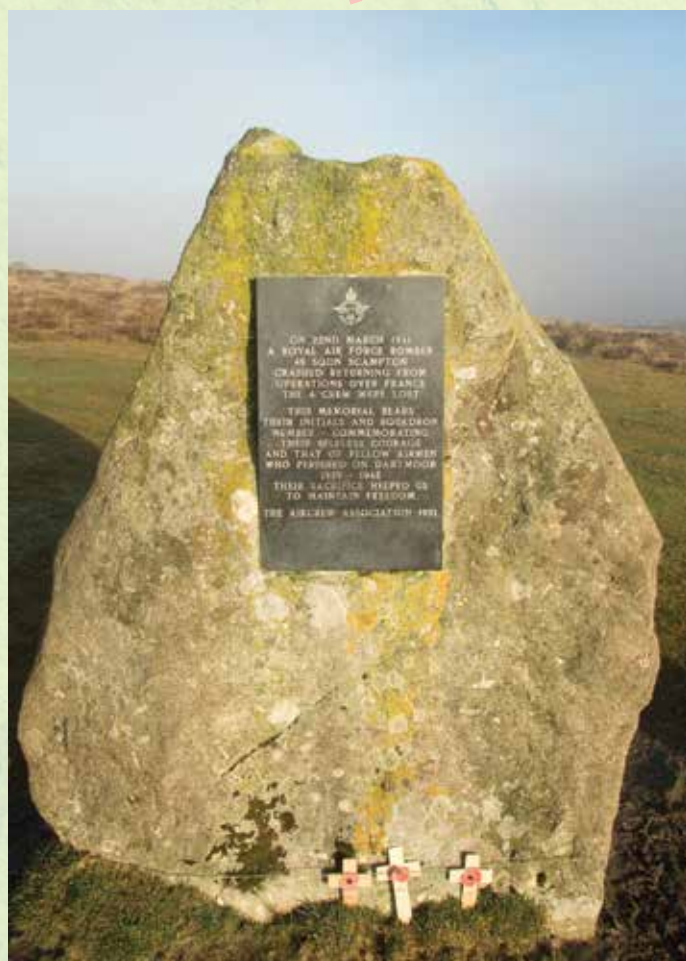
RAF Memorial Plaque

(Shortcut - follow the lilac line on the map to join the Two Moors Way that runs along the top of Hameldown)