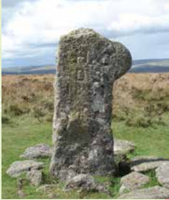
Hameldown Cross picture taken 2008